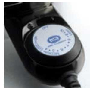
When inserting the probe in the socket, ensure the probe is set on Off .