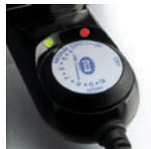
A glowing green light indicates that the Electroraost is heating up.